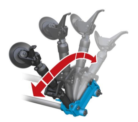
Automatic arm positioning