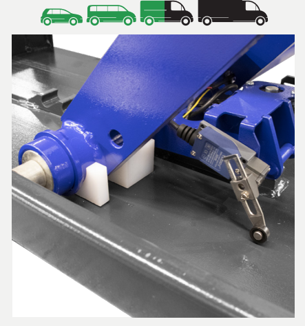
Sync Safety system