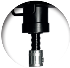
Adjustable Mounting head