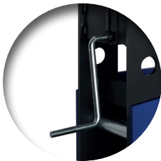
Hand winch Work bed