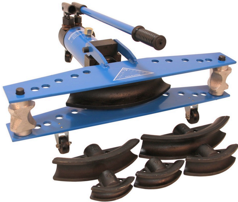
Mammuth Manual Pipe Bender SWG2